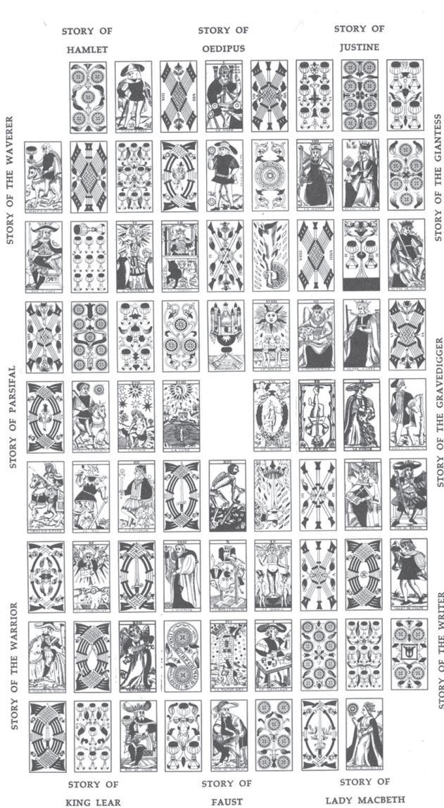
Figure 3. Final array of Tarot cards used to tell stories of guests robbed of their power of speech (Italo Calvino, Castle of Crossed Destinies, 1973). The reuse of cards to work in multiple stories, running vertically, horizontally, diagonally, or in the same row with additions or subtractions, folds the array to reveal a meta-literary set of fracture lines or medians. This define literature's fractal quality, its status as a quantum field.

finishes the story without ever getting the point or grasping the wit of the text. For the reader who "gets it," the stories constitute an idea that the reader can finish in her head without the author's assistance. 11 The story idea is in fact transferred from artist to audience. The moment and work of completion is "enthymemic" — that is, ceded to the "passive reader" whose real (Zairja) activity involves suffering that follows