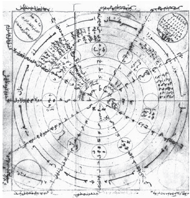
Figure 1. Surviving Zairjas feature astrological charts and numerical/alphabetical matrices, but there are references to mechanical examples.

What does the Zairja offer to the modern thinker or, more specifically, architectural educators and their students? I propose that the Zairja idea may be extended to bridge between the formless and form, the idea and sensible shape. The Zairja requires rigorous methodological exactitude while at the same time it resists restrictive preconceptions. The Zairja is virtually unknown in architectural education literature, even among IT enthusiasts, even though it figured prominently in the work of starchitect Daniel Libeskind, who used Jonathan Swift’s version of it as a model for his “writing machine,” submitted for exhibition at the Venice Biennale of 1985 (Fig. 2). 3